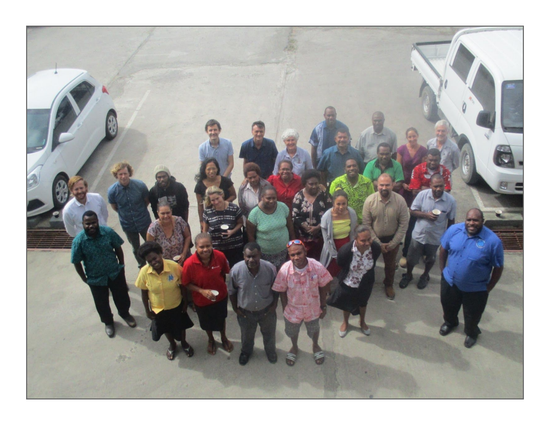
Figure 1: Workshop participants

Each group reviewed the response to Tropical Cyclone Donna and identified things that worked well and those areas that needed further improvement. From this, each group produced a list of three priority recommendations. Groups were specifically asked to use the 'SMART' guidelines to making recommendations. Each recommendation should be: Specific, Measurable, Achievable, Relevant, and have a Timeframe. This report outlines those recommendations.