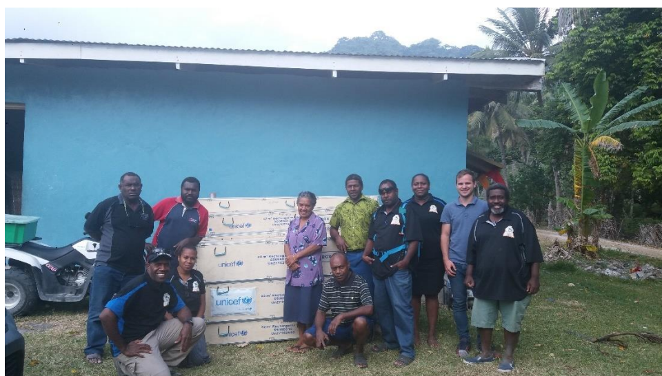
MoET team with UNICEF supplied six 42m 2 tents to be used as Temporary Learning Spaces for children displaced from Ambae.