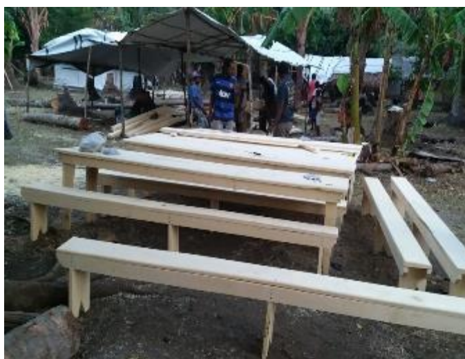
The Joinery Team at work with building of tables and benches to put in the Temporary Learning sites.