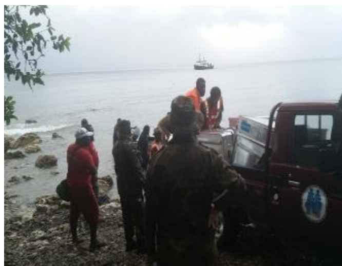
MoET working with Save the Children, NDMO and VMFs to off load Education Supplies off MV Aganda.