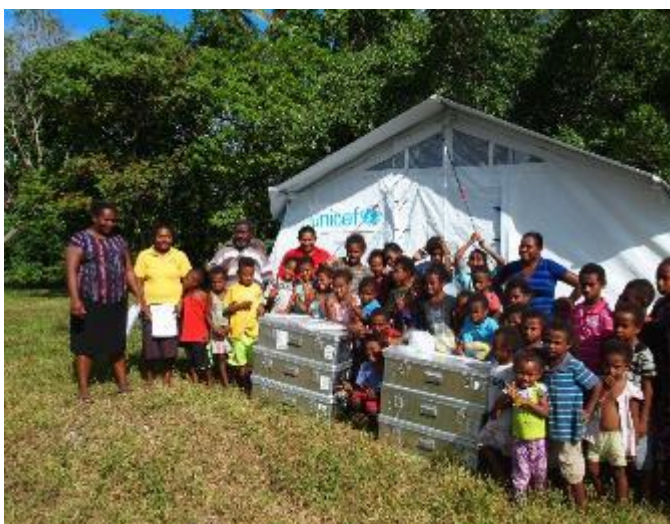
MoET team handing over UNICEF supplied school supplies to Marino TLS.