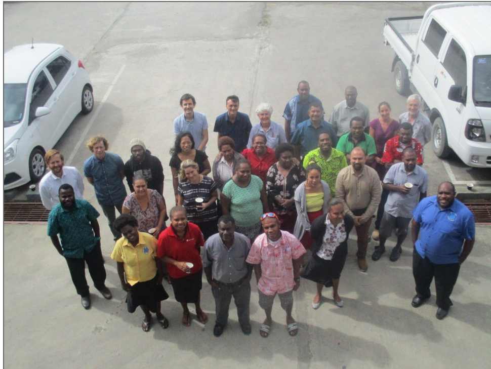
Figure 1: Workshop participants

Each group reviewed the response to Tropical Cyclone Donna and identified things that worked well and those areas that needed further improvement. From this, each group produced a list of three priority recommendations. Groups were specifically asked to use the 'SMART' guidelines to making recommendations. Each recommendation should be: Specific, Measurable, Achievable, Relevant, and have a Timeframe. This report outlines those recommendations.